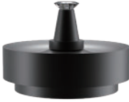
g. Rotating Platform for Double-Sided Cone Stage Holder