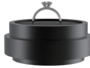
f. Rotating Platform for Jewellery Holder